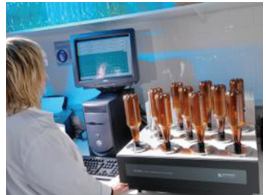
Test 11 chambers at once

One analyzer has the ability to evaluate a wide range of barrier alternatives and their corresponding performance.