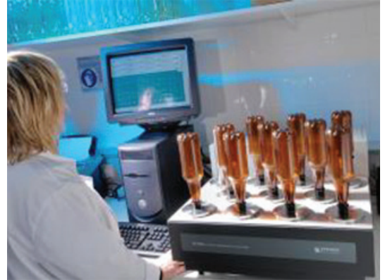
Test 11 chambers at once

One analyzer has the ability to evaluate a wide range of barrier alternatives and their corresponding performance.