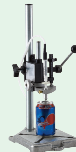
Can Piercing Station

The can piercing station is perfect for rigid packaging and has proven to be stable and reliable in hundreds of demanding applications.