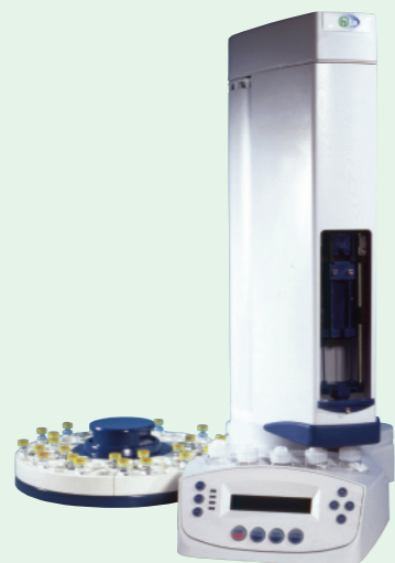
Vial Autosampler Option

Ensures the instrument is always performing to it's highest degree of accuracy - essential for HACCP compliance.